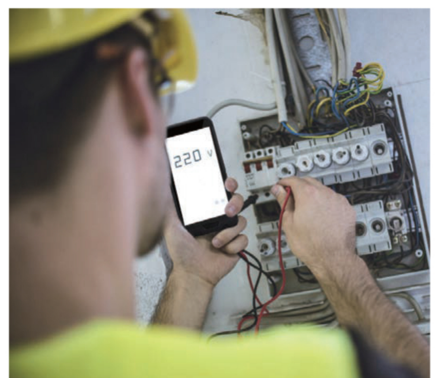
Electric Power Inspection